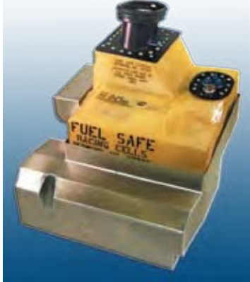
Porsche 997 GT3R

Porsche 911/997 - 27 gallons, with double dry break, collector/reserve tank with 4 scavenge pumps, 2 Bosch 044 supply pumps and a low level float switch.