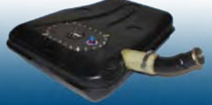
Porsche 356 B/C

Porsche 356 T6 chassis - 10 gallons, with custom fill plate and sending unit. Customer must provide factory tank.