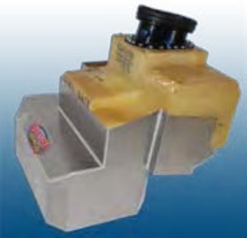
Porsche 996 GT3R

Porsche 911/996 - 27 gallons, with 100 mm double dry break, collector/reserve tank with 2 scavenge pumps and low level sender.