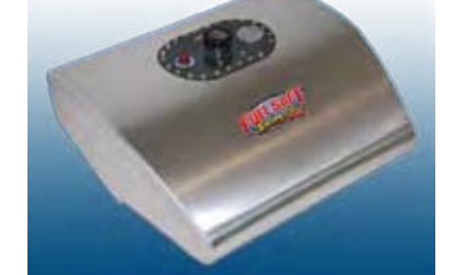
Porsche 356 A/B

Porsche 356 T5 chassis - 20 gallons, with SF6X10A fill plate with -6 vent, sender provision, -6 pickup.