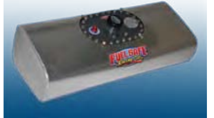
Porsche 356 A/B

Porsche 356 T5 chassis - 12 gallons, SF6X10A fill plate with -6 vent, a sender provision, -6 pickup.