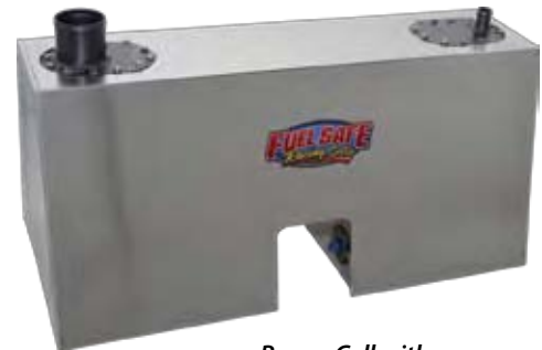
Buggy Cell with standard dual -6 pickups

Fuel Safe offers factory designed Pro Cell® and Enduro Cell® off road systems that give you all the performance and safety of a custom cell without the custom price. Compatible with gasoline, diesel and E85 fuels, Fuel Safe's off road cells offer maximum performance and durability. Upgrade your off road cell with a collector, in-tank pump(s) or dry break for superior performance and fuel delivery. All Fuel Safe off road cells come standard with the following components: