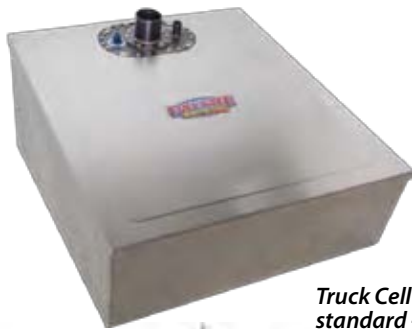
Truck Cell with standard -8 pickup