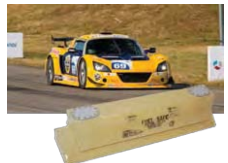
Custom Fuel Cell for Classic Sports Car