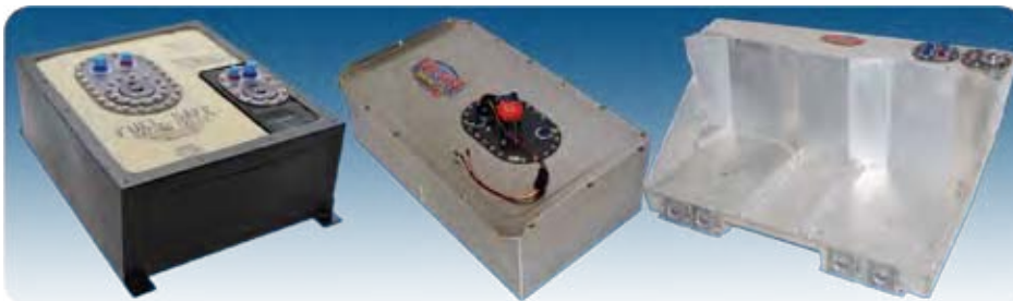
Custom Cell with Dual Bladders