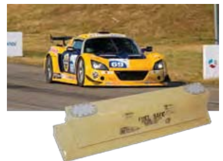
Custom Fuel Cell for Classic Sports Car