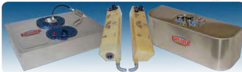
Custom Fuel Cell for Hot Rod