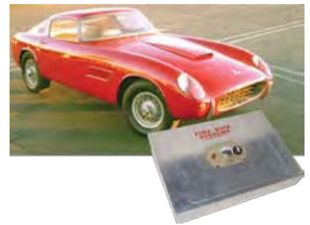
Custom Spare Tire Fuel Cell