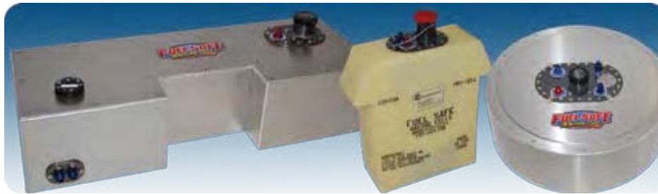
Custom Fuel Cell for Rally Car